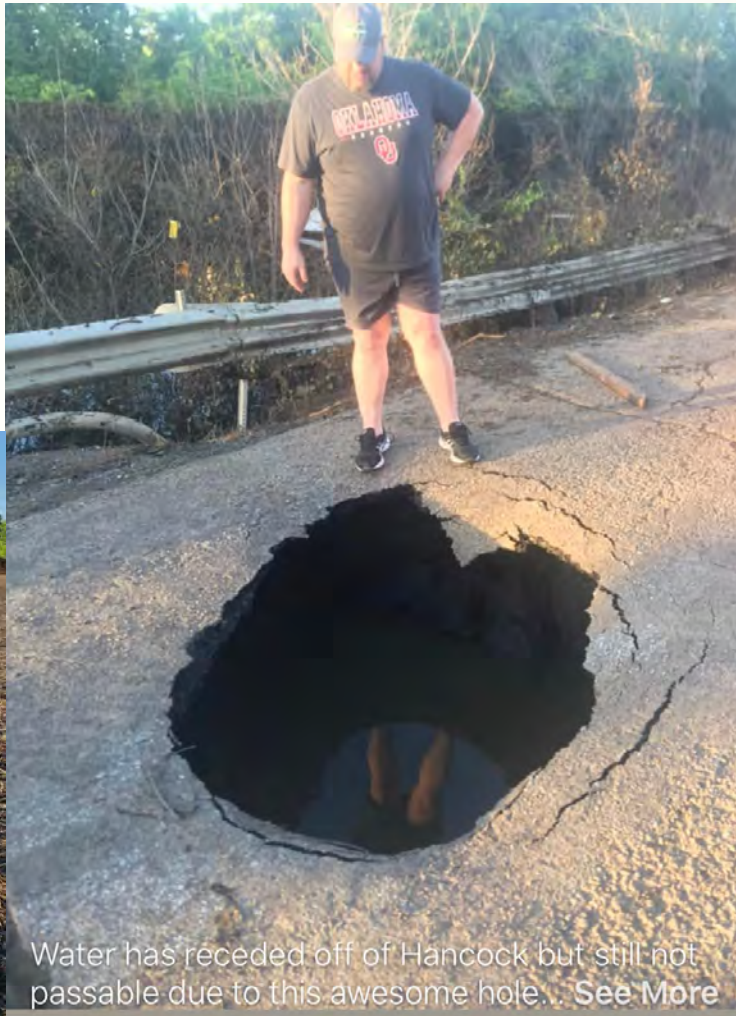
Water has receded off of Hancock but still not passable due to this awesome hole. See More